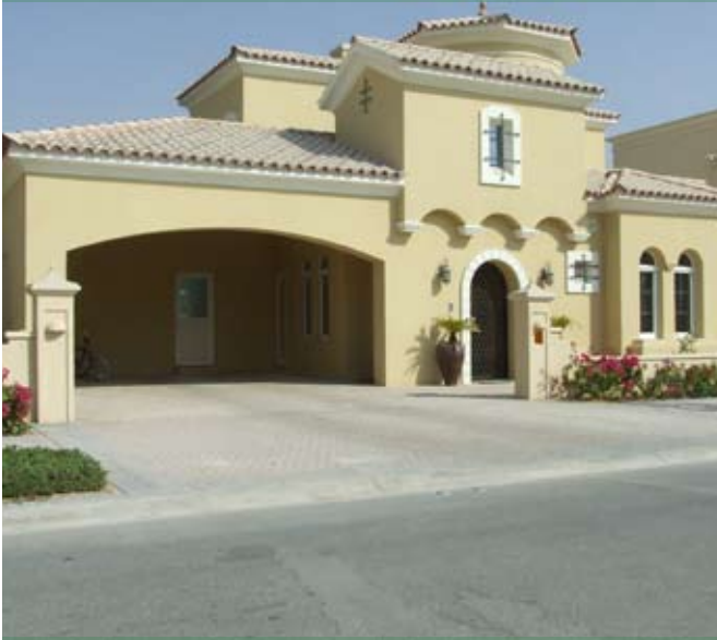
ALVORADA - TYPE A1, 3 BR + M

REF CODE: AR-AV041 ALVORADA TYPE A1 3 BEDROOMS + MAID'S ROOM EXCEPTIONAL FINISHES BUILT UP AREA: 3765 SQ. FT PLOT SIZE: 8500 SQ. FT READY FOR POSSESSION