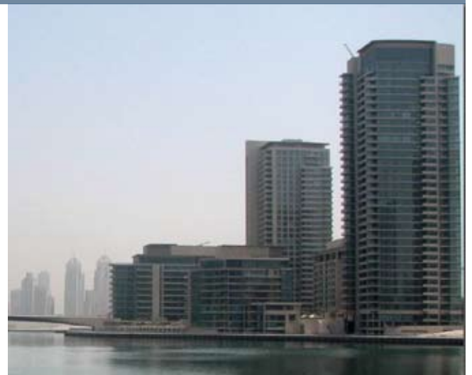
AL MAJARA 2 , 3 BR